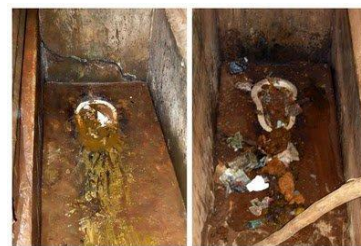
Before and after the CCS team’s intervention