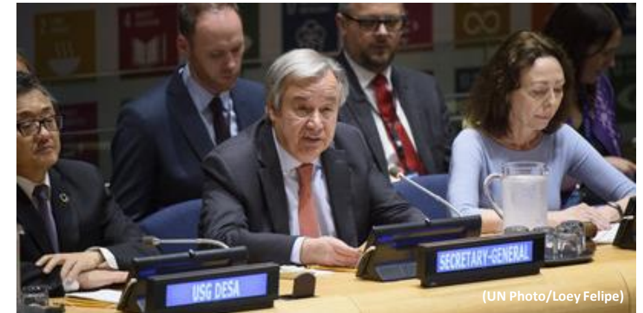
Secretary-General António Guterres (centre) addresses the closing session of the High-level Political Forum on Sustainable Development

As in previous years, the forum closed with the adoption of a Ministerial Declaration in which member states reaffirmed their commitment to effectively implementing the 2030 Agenda for Sustainable Development for all people, everywhere.