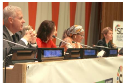
Opening plenary of the SDG Business Forum

Amina J. Mohammed, Deputy Secretary-General of the United Nations opened the session by underlining the critical role that a dynamically engaged business community has to play in realizing the SDGs and noted that it is “encouraging to see business responding to the 2030 agenda at an unprecedented scale”.