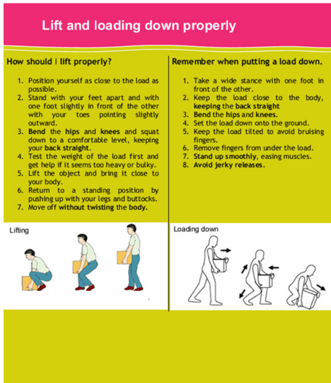
Figure 2: Our safety bulletin provides advice on correct ergonomic procedures

We make sure that all our new employees are aware of best practice in terms of adjusting their workstation. We have an induction film, which features our staff and shows new employees how to set their workstations to the best ergonomic standards.