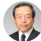
Takeshi Uchiyamada Chairman of the Board, Toyota Motor Corporation