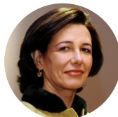
Ana Botín Executive Chairman, Banco Santander