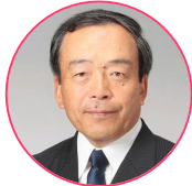
Takeshi Uchiyamada Toyota