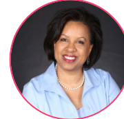
Toni Townes-Whitley Microsoft