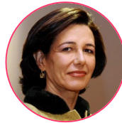
Ana Botín Santander